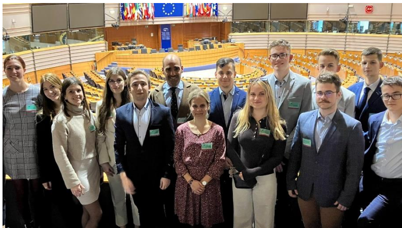
Visit to the European Parliament, 26th October

At the end of October 2022, the Centre organised a study trip to Brussels with a delegation of 12 students, where they met EU officials from the European Commission and the European Council and Members of the European Parliament.