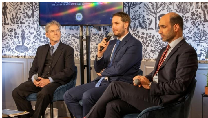
MCC-ISSEP conference, 7th February