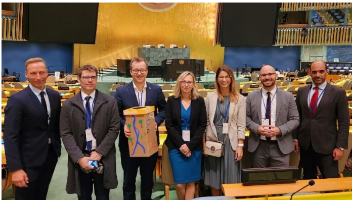
Challenges of Green Transition, UN Headquarters, 4th October