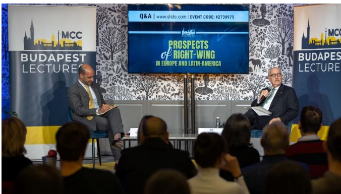
Budapest Lecture with Andrés Pastrana Arango, 13rd October