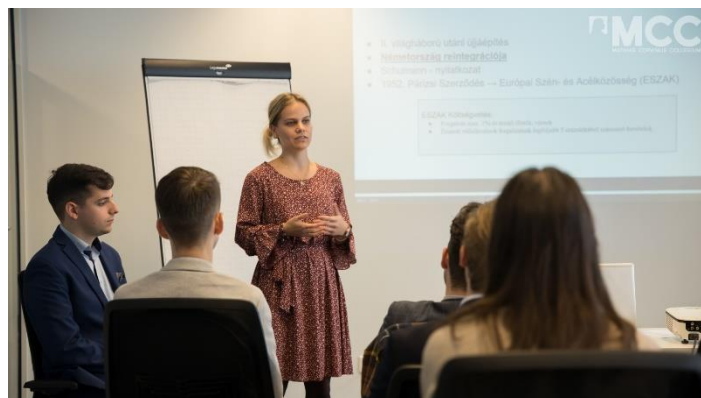
Giving lectures about the historical background of the EU in Brussels

The Center also organised the professional programme for the Autumn Academy , which is a compulsory annual event organised by the school. The weekend was held in Győr, where the students examined the consequences of the Russian-Ukrainian war, looking at different regions and countries around the world. To conclude the programme, they took part in a simulation game where they were able to participate in a possible peace negotiation process. The game was also organised, led and developed by two members of our Center.