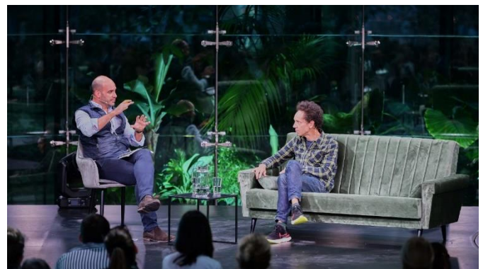
Brain Bar with Malcolm Gladwell, 30th September