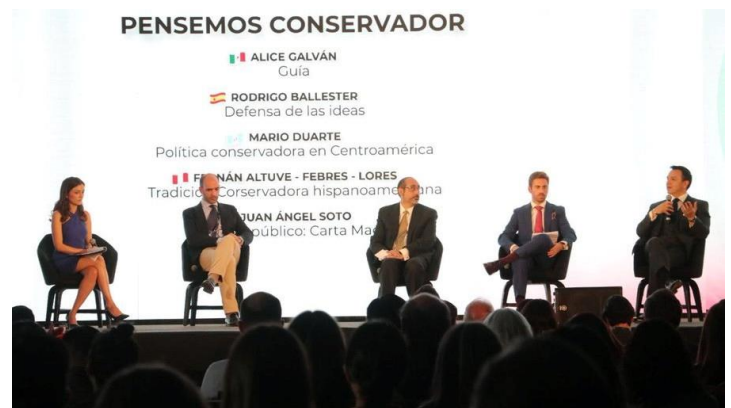
CPAC Mexico, Defensa de las ideas, 19th November